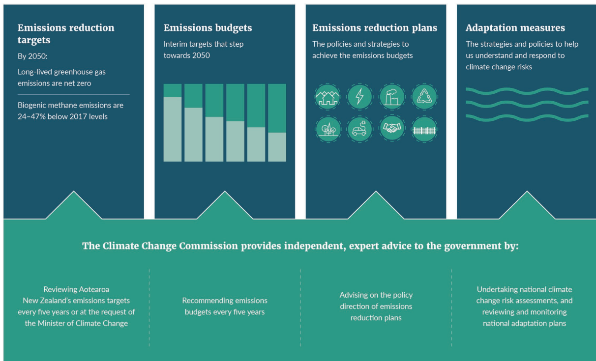
Figure 2.1 provides a summary of the Climate Change Response Act’s architecture with respect to targets, emissions budgets and ERPs.

Unlike emissions budgets, there is no requirement for the minister to explain any deviation from the Commission’s advice on ERPs.